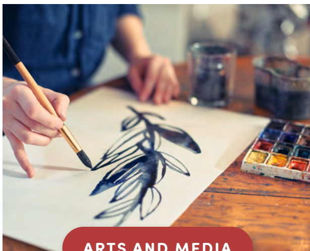
ARTS AND MEDIA

Click the department to view our online courses on our website