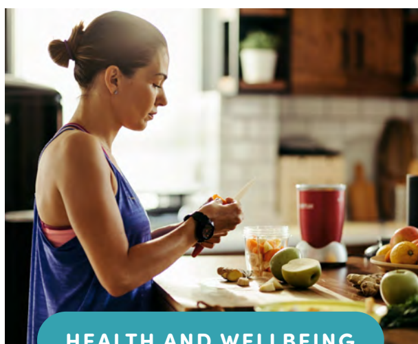
HEALTH AND WELLBEING