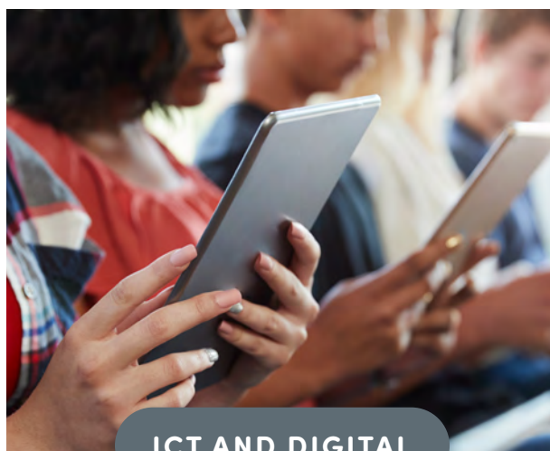
ICT AND DIGITAL