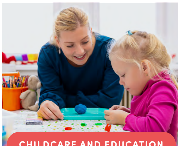
CHILDCARE AND EDUCATION